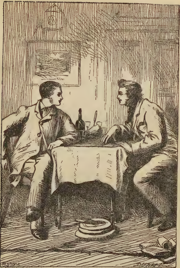
LECTURING ON CAPITAL.